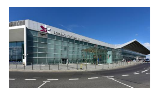
WARSAW CHOPIN AIRPORT – 165 km from Lublin – 1,40 minutes to Lublin

https://www.lotnisko-chopina.pl/en/index.html